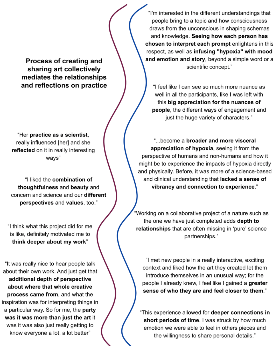
Fig. 2: Selected quotes from participants' surveys and interviews illustrating how the process of creating and sharing art collectively mediates the relationships and reflections on practice.

Overall, the process of creating and sharing art collectively seems to be able to strengthen relationships by adding more emotional depth and opportunities to explore more creative approaches and questions. Figure 2 below illustrates these insights through some selected quotes.