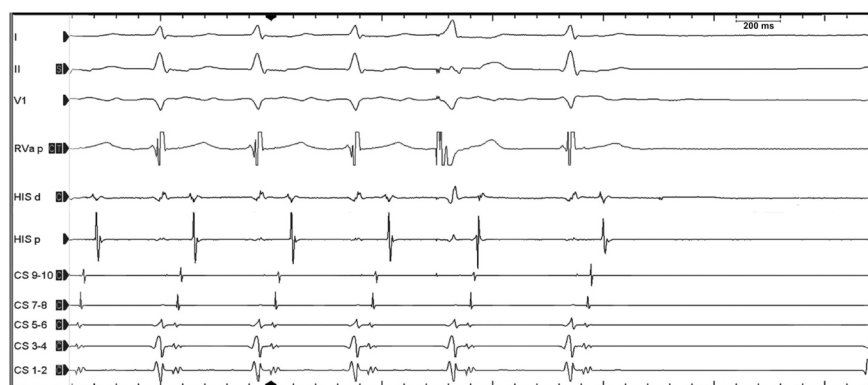
Figure 1. A single ventricular extrastimulus applied from the right ventricular apex (RVa) during the tachycardia. RVa p= Right ventricular apex proximal, HIS d= His bundle distal, HIS p= His bundle proximal, CS= Coronary sinus.