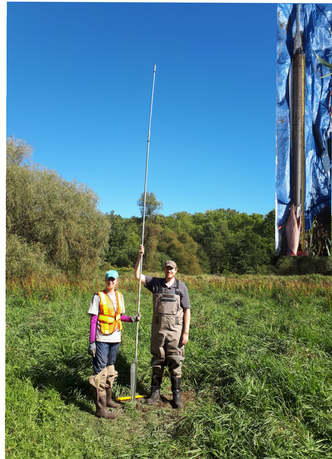
Sediment core collected from Central Big Creek using a Russian peat corer

• How have rates of carbon accumulation been affected by anthropogenic pressures (i.e., intensive land-use, nutrient loading, invasive species)? Methods: Use of diatoms as a bioindicator of wetland ecosystem health