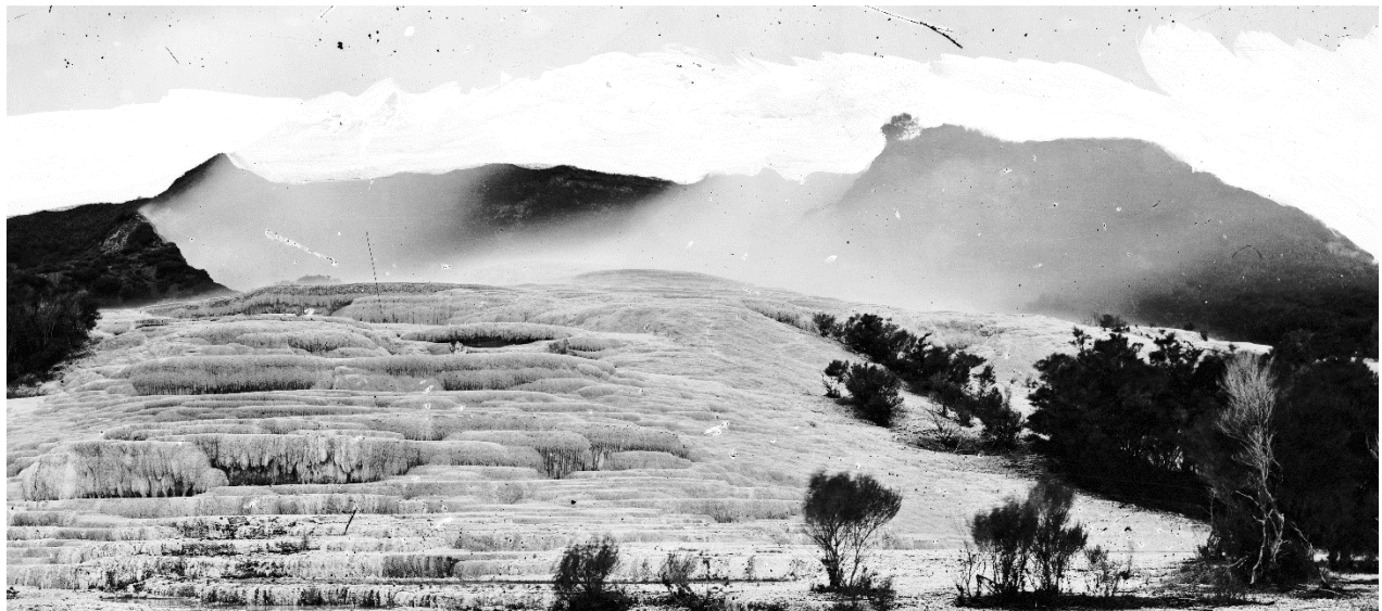
Fig. 2. White Terrace, under a strong north wind (cropped). Steaming-fog may be blowing across the southern Terraces. 1885, Burton, Te Papa (C.014925).

I can find no surviving photographs witnessing this Coandă effect phenomenon, probably because the accompanying strong easterly winds would prevent canoe transport of the heavy cameras, (and prior to the mid-1880's), the bulky portable darkroom required on site at the Terraces. These items had to travel east by dugout canoes (with little freeboard) across Lake Tarawera, to the Kaiwaka Channel and up it to Lake Rotomahana. Also, the longer exposure times of wet-plate cameras in the earlier tourism period at the Terraces, would anyway preclude the effect being recorded (Bunn, 2019). In Figure 2, the effect of a north wind is shown across Tarata Spring, in a photograph taken on a later, dry-plate camera. The steaming-fog is blown from left to right across the embankment entrance and down over the southern Terraces. There is possible evidence of a Coandă effect over the upper Terraces, but this may also be localised steaming-fog over a hot waterfall recorded there.